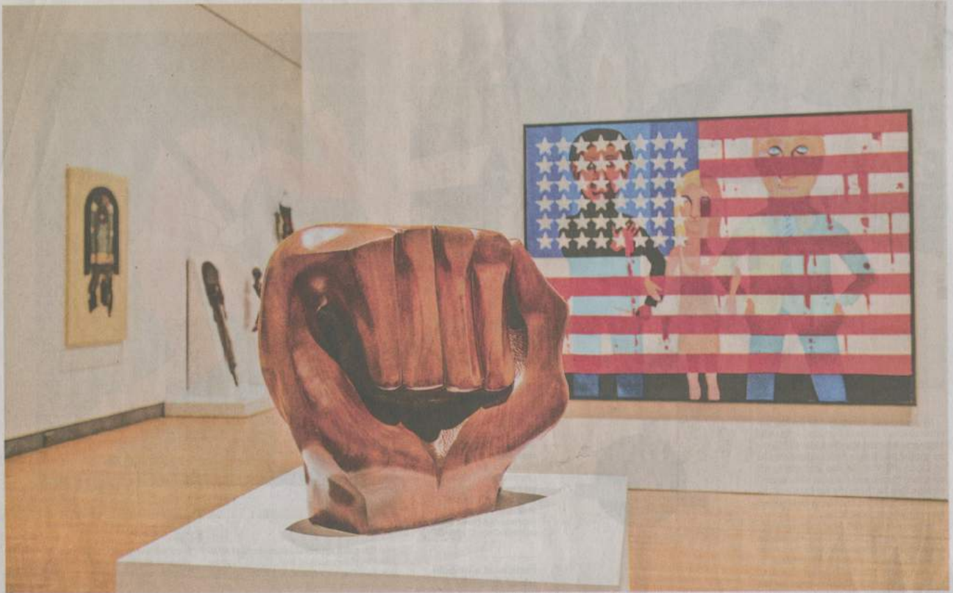
PHOTOGRAPH BY GEORGE THEREDGE FOR THE NEW YORK TIMES. ABOVE AND BELOW: 2018 CATLETT MORA FAMILY TRUST, LICENSED BY YAGSA AT ARTISTS RIGHTS SOCIETY (ARS), NY